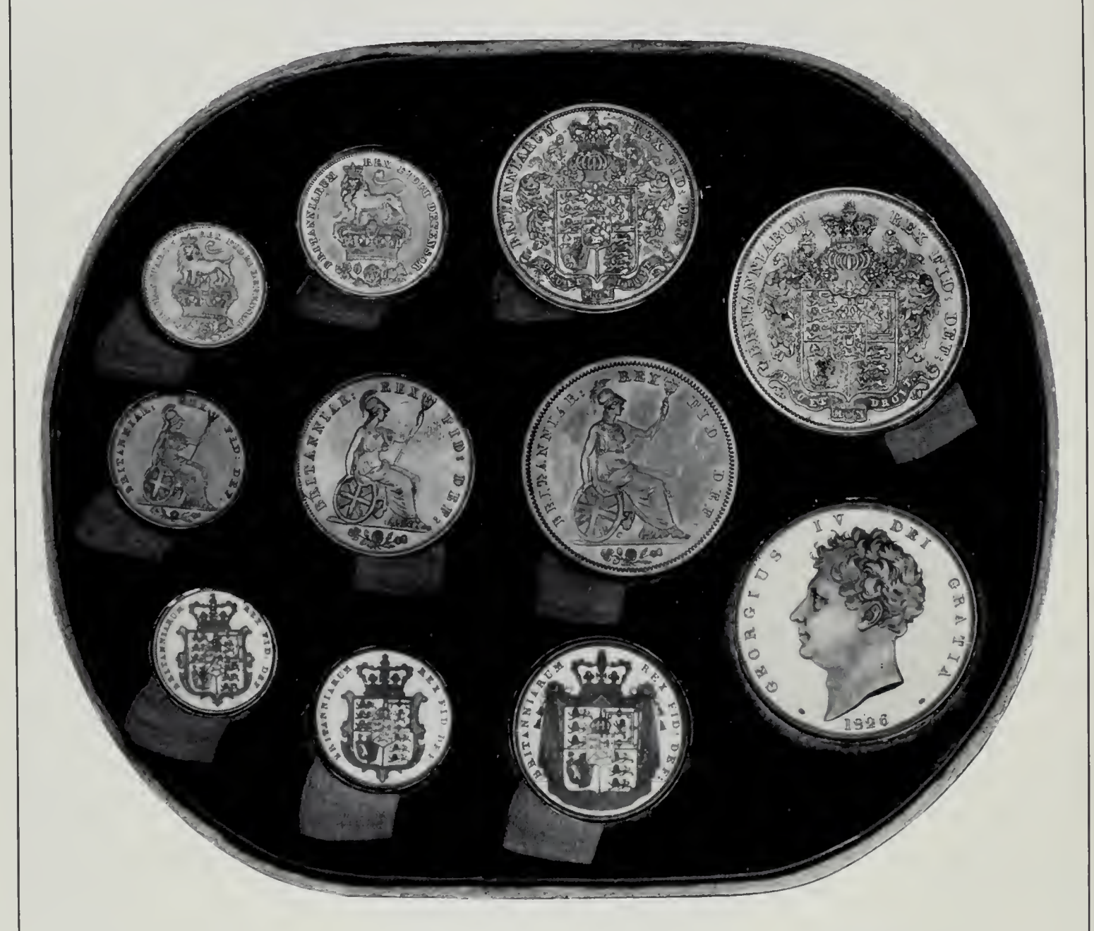
Lot No. 2892

Proof Set, 1826. Includes the Gold Five Pounds, Two Pounds, Sovereign and Half Sovereign; Silver Crown, Halfcrown, Shilling and Sixpence; Bronzed Copper Penny, Halfpenny and Farthing. The Five Pounds, Two Pounds and Crown were struck in Proof only and have the edge date SEPTIMO, the other Gold and Silver coins have reeded edges. A well-matched, original set. The Silver has deep, clear toning and the Copper pieces have similar steel blue undertones. The Gold coins are particularly nice, the Two Pounds and Sovereign being exceptional. A very rare set. Only 150 complete sets were sold. Accompanied by its original red leather case. (The set's owner in 1868 had his name and the date stamped in Gold on the outside.) 11 pieces.